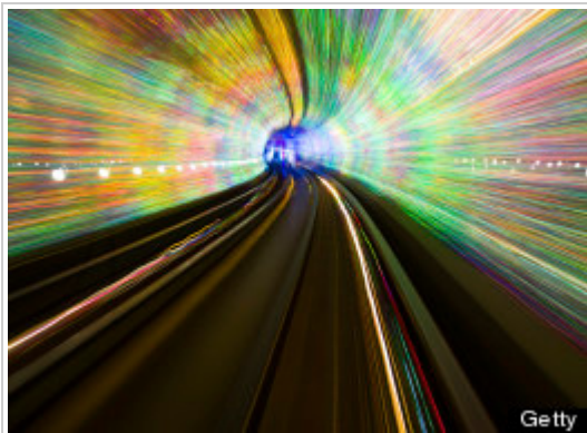
Abstract image of light waves in deep tunnel.

Posted: 16/07/2013 10:47 BST | Updated: 16/07/2013 11:10 BST