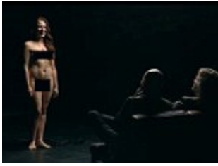
Is this the most sexist TV programme in history? Chat show...