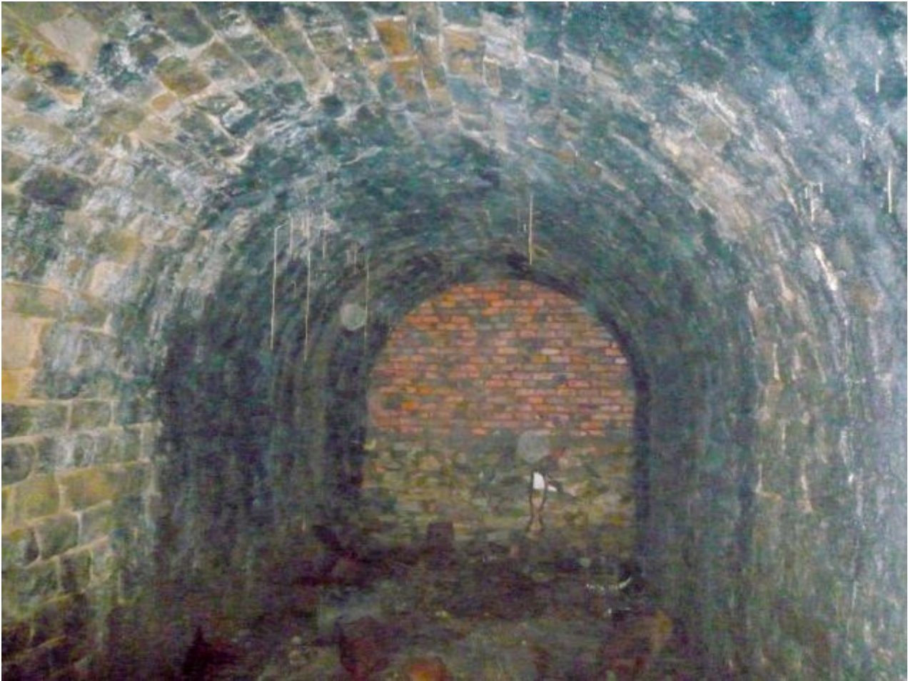
Historic: The tunnel is connected to the Butterley Gangroad, a horse-operated railway built in 1793, by the Butterley Company, a large local engineering firm