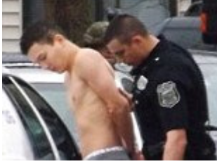
Boston bomber Dzhokar's sickening 'lol' text to his three...