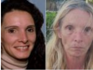
Married mother-of-two revealed to be living homeless in...