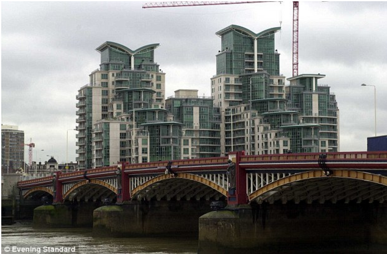
The Butterley Company, who built the tunnel, also provided the ironwork for some of Britain's most iconic buildings, including Vauxhall Bridge