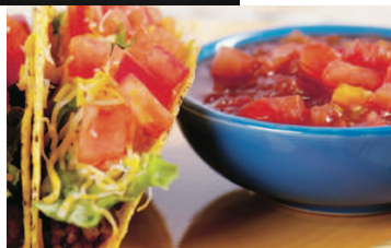
Turkey Fajitas Fresh off the Grill