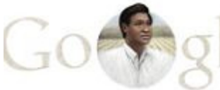
• Google celebrates leftist leader Cesar Chavez, not Easter,...