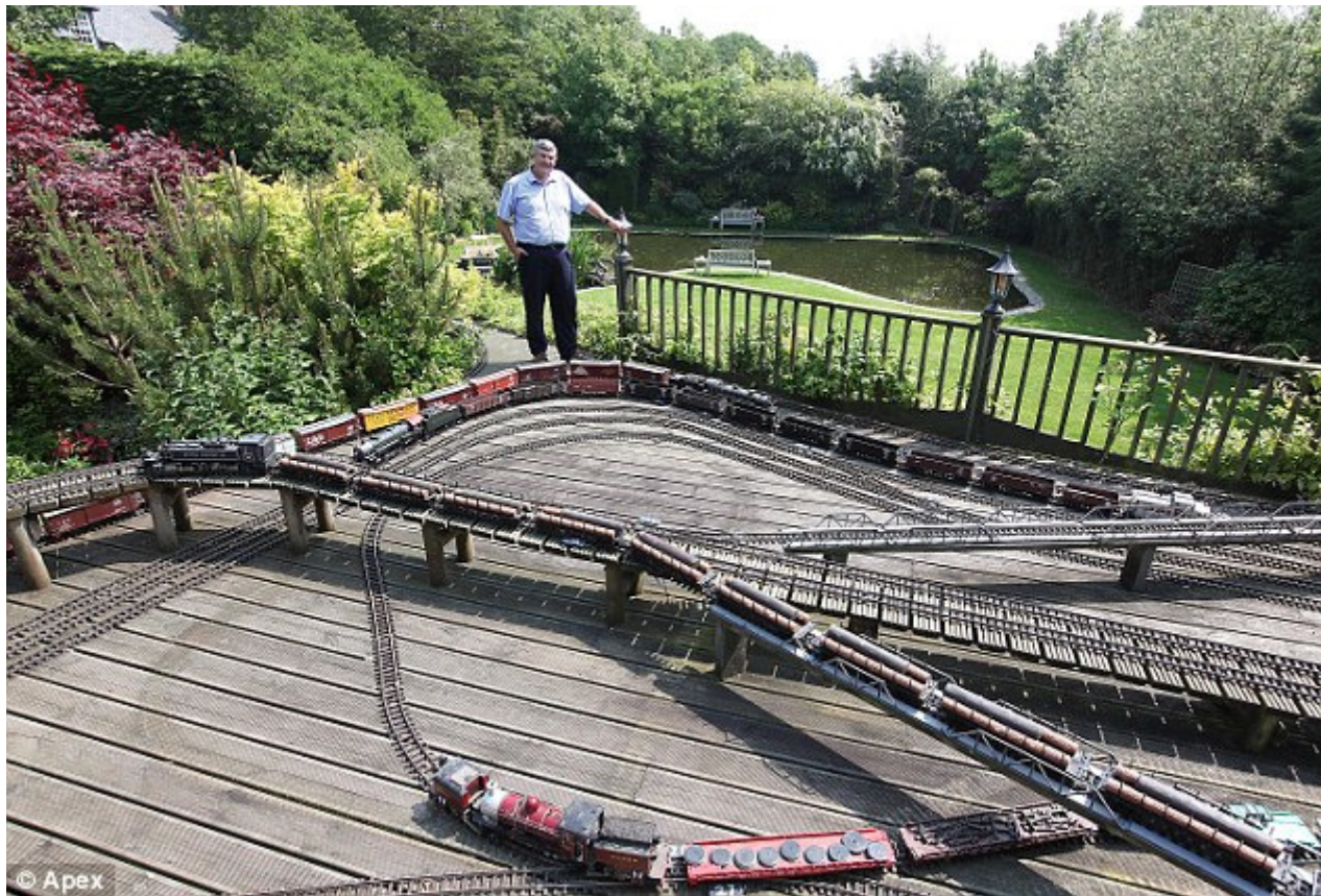
Chuffed: The impressive set is sure to bring out the little boy in all rail enthusiasts