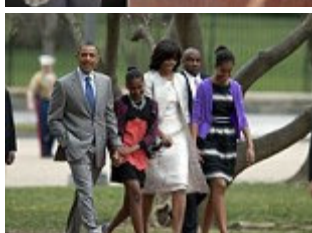
• Full of the joys of spring! First Family take a spring walk...