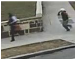
• Police hunt for kidnappers as couple are snatched at...