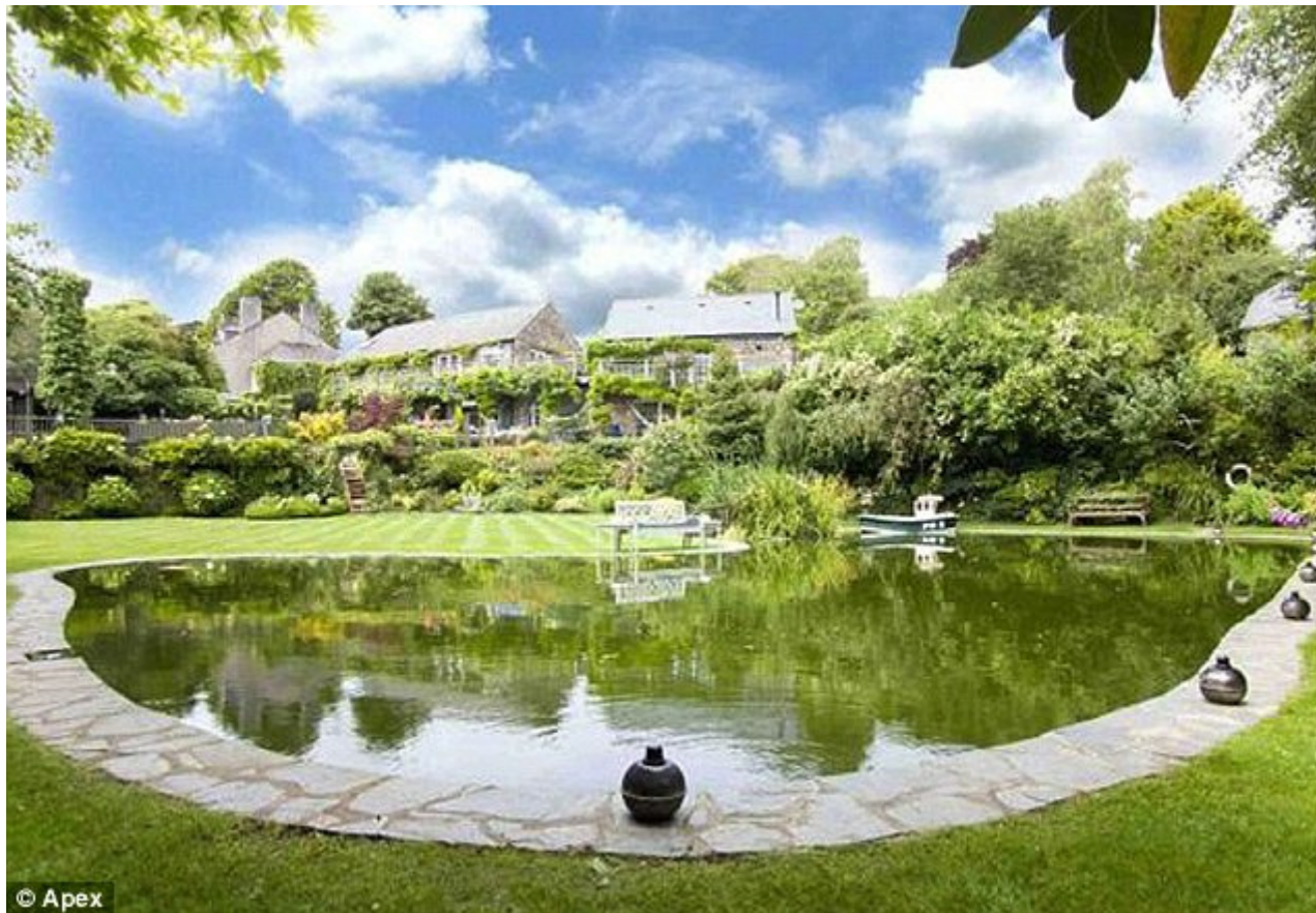
Bespoke: The home includes a drawing family and dining room along with a separate flat and a landscaped garden featuring a lake, and an outdoor hot tub

'It will be a different sort of life. We love living in Plymouth but we have always felt like we live in the country here - we look out onto a valley from our terrace but at the same time we're just a short way from the city centre.'