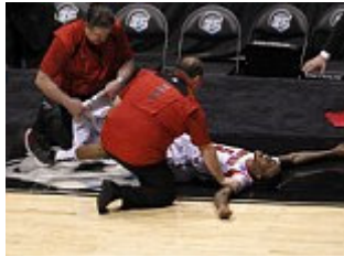
• Prayers for Louisville player after horrific injury in front...