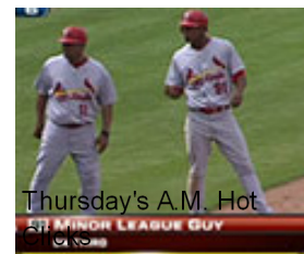
Thursday's A.M. Hot MINOR LEAGUE GUY