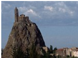
• Hidden in caves 600ft below ground, carved into volcanic...