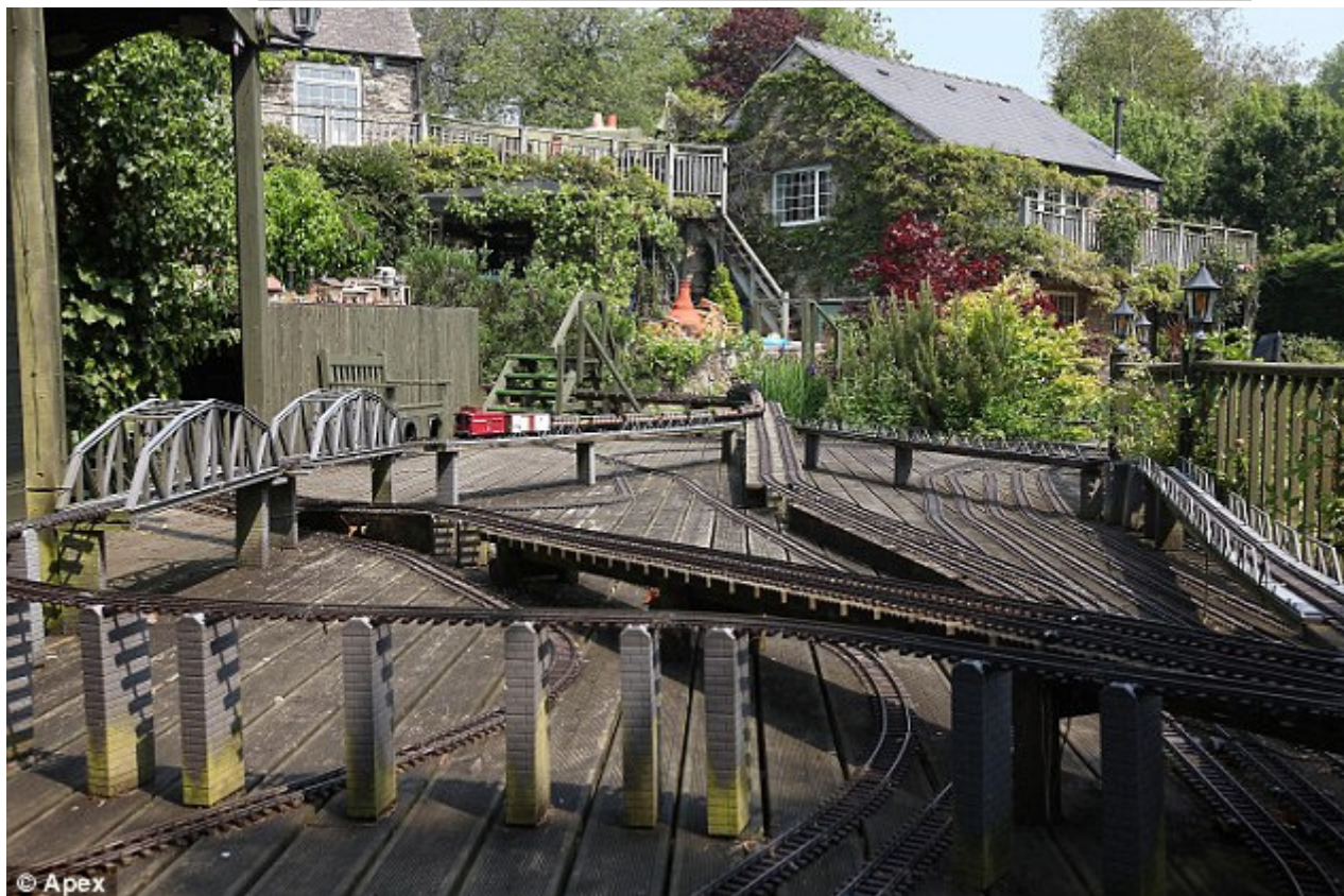
Choo choo: In news that will excite rail enthusiasts everywhere, this six bedroom property in Plymouth, Devon, has been put up for sale for £800,000