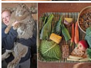
• The ultimate Easter bunny: Heavyweight Ralph weighs 3st 8lbs...