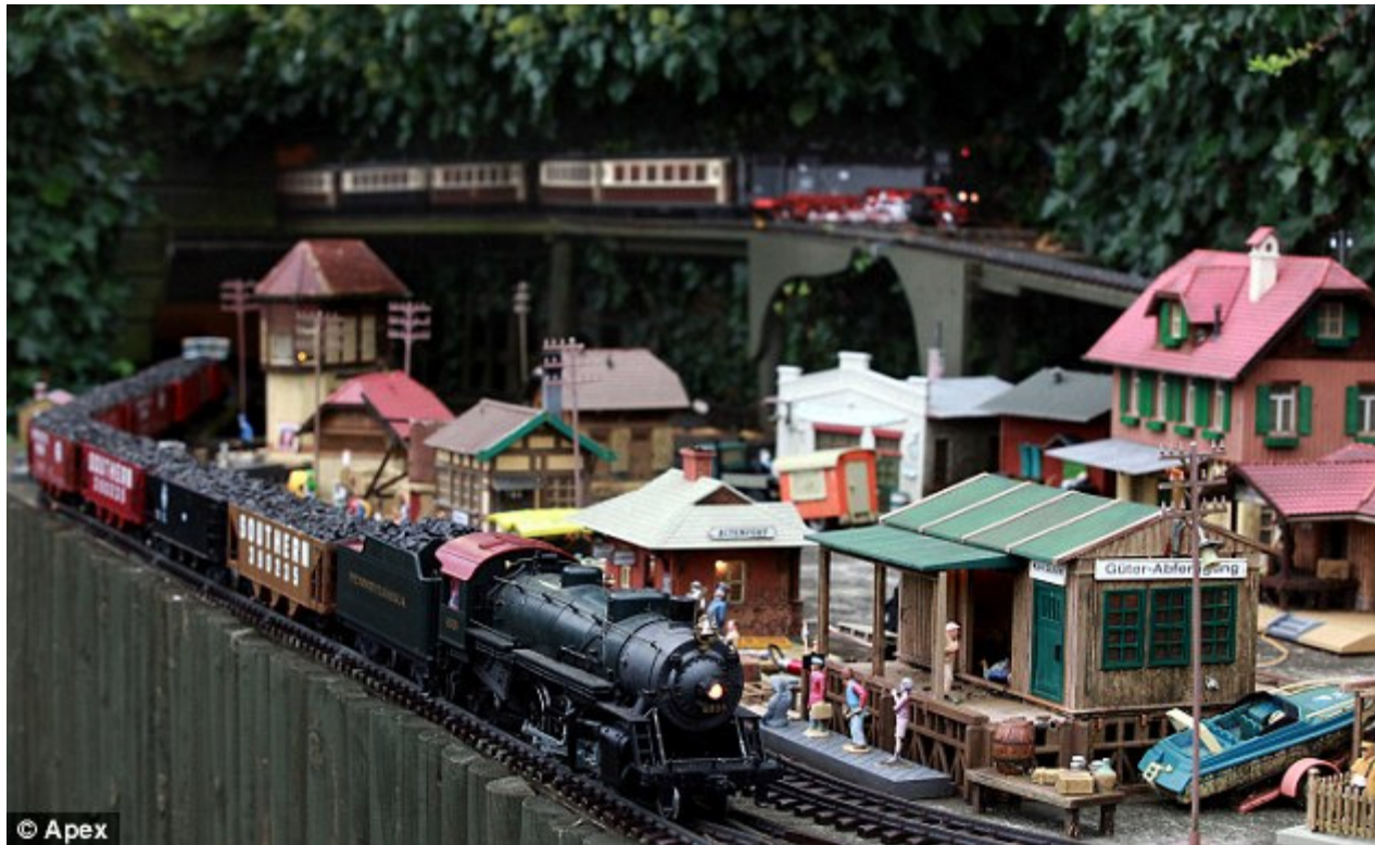
Carefully created: The self-made millionaire and business leader - chairman of the First Great Western Trains advisory board - is a keen rail enthusiast and loving built the railway