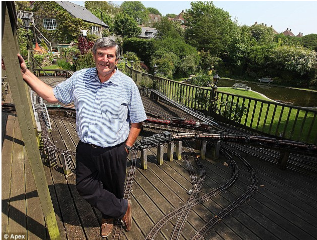
Childhood dream: The site used to be a cluster of outhouses and barns which the Howesons converted into a large-scale family home 13 years ago, and soon installed the track