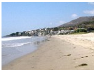
• The celebrities fighting to stop their homes being swept...