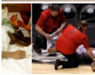
• 'Don't worry about me, go out and win this thing': Heroic...