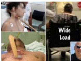
• 'Patients galore, all ripped apart and mangled': 'Bad...