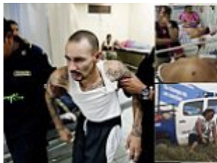
• The most dangerous place on earth? San Pedro Sula in...