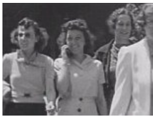
• Was this the world's first mobile phone? 1938 film shows...