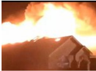
• Family's anguish as they're forced to watch their home burn...