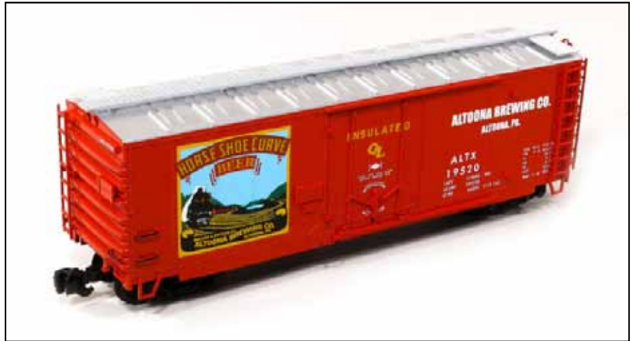
The 2013 ECLSTS Show Car - Horseshoe Curve Beer Plug Door Boxcar

show is you can "see it, touch it, and in some cases, you can see it run or take it to a test track before you take it home.