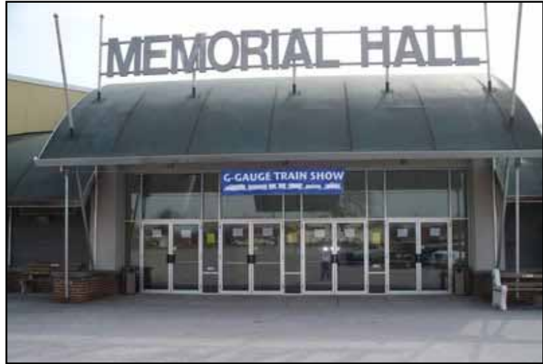
Memorial Hall at the York Fagrounds - Home of the ECLSTS

Be sure to thank the vendors and the clubs for coming to the show. I have always said there is a 'two-edged sword' with the shows. If the public does not attend, the vendors will not attend, and if the vendors do not attend, the public will not come. So if you attend and buy, then the vendors keep coming back. In some cases, you will find what you want at the show CHEAPER than you would at their store or online. One part of the 'sale equation' is gone at the shows, THE SHIPPING charges. The shipping charge for track can get expensive. The other advantage of the