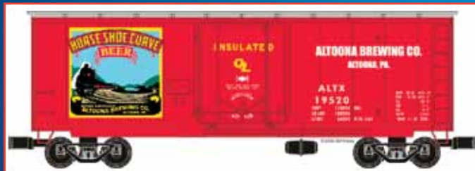
Special Edition 2013 ECLSTS 40' Plug Door Boxcar

HOURS: FRIDAY 9:00 A.M. TO 6:00 P.M. SATURDAY 9:00 A.M. TO 4:00 P.M.