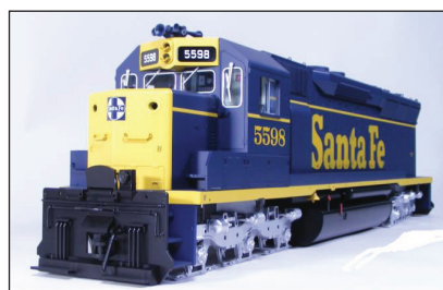
22423 - ATSF