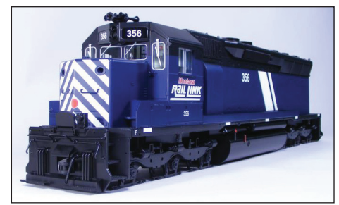
22421 - MONTANA RAIL LINE