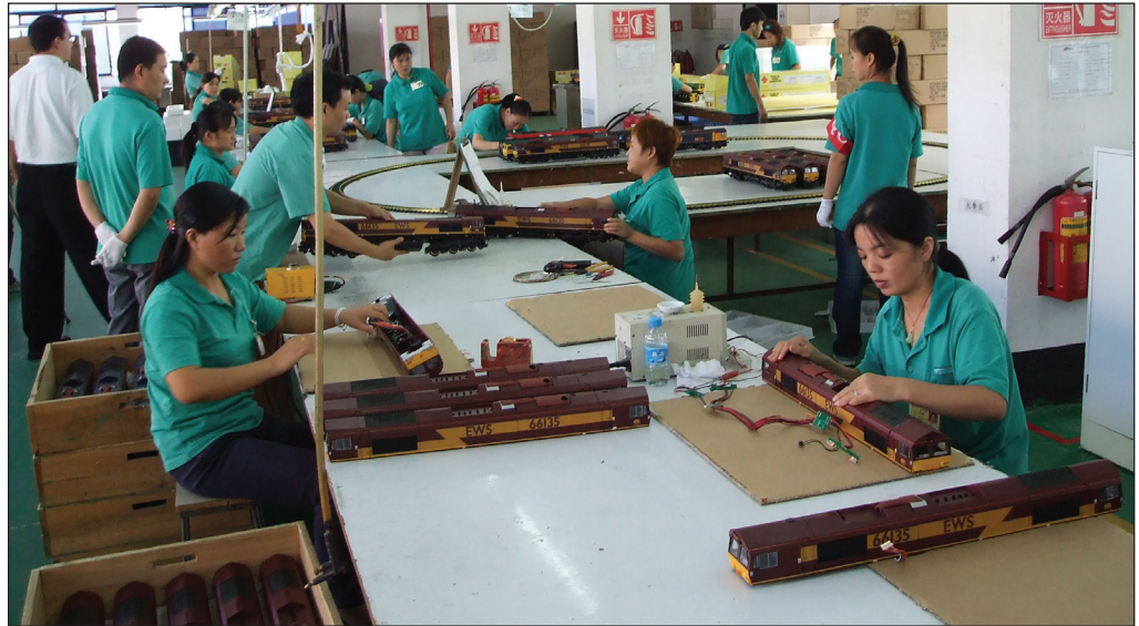
The Aristo-Craft Factory Assembly Line

While it's true that plastic is injected in-house, most everything else is delivered in the "Just In Time"