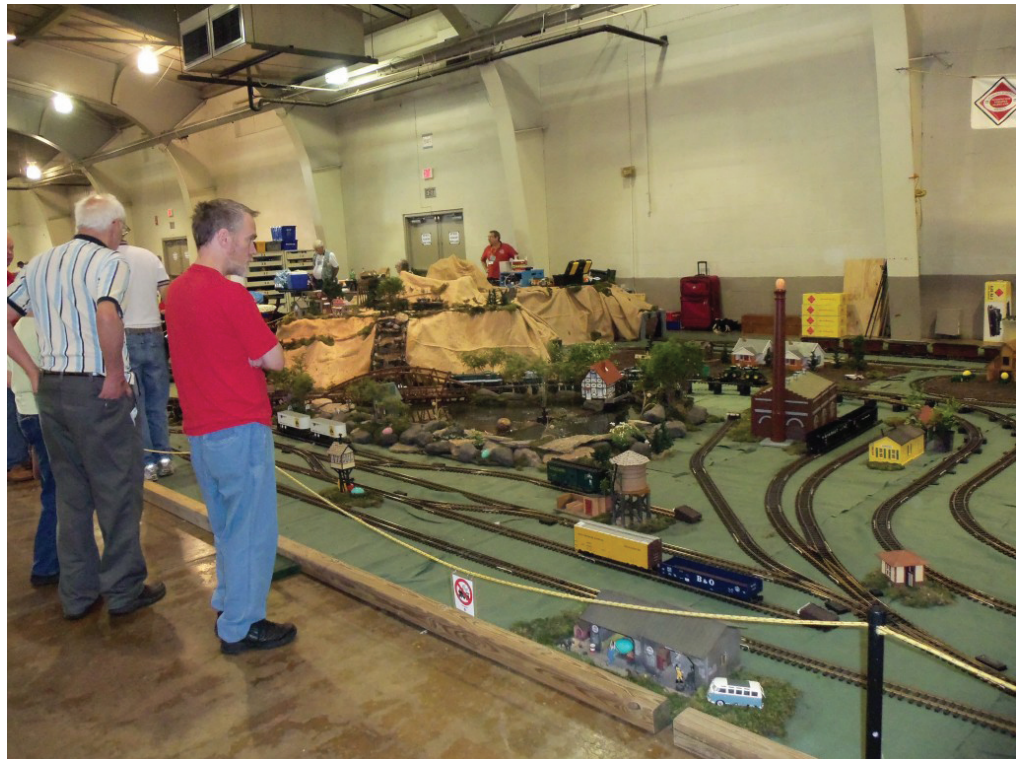
Enjoying one of the layouts at the ECLSTS

Then permission needs to be obtained to be able to use their names and/or logos on the car. Sometimes the companies get back to you right away and sometimes they will require a "royalty fee." Whatever we choose for the 2013 ECLSTS, it surely will be something that has not been produced before.