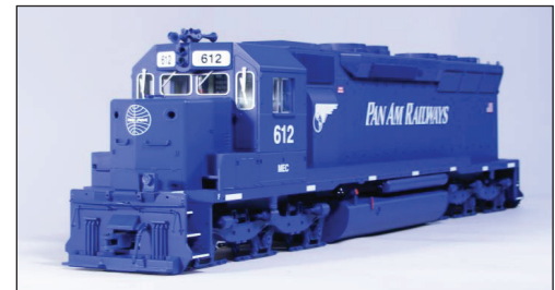
22426 - PAN AM RAILWAYS