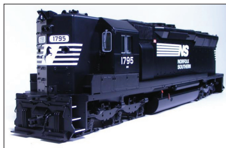
22407 - NS HI-NOSE

New SD-45 models are in production right now. Here are the first test shots of the new paint schemes: 22407 NS Hi-Nose, 22421 Montana Rail Line, 22423 ATSF, and 22426 - Pan Am Railways. These items will be in stock later this year.