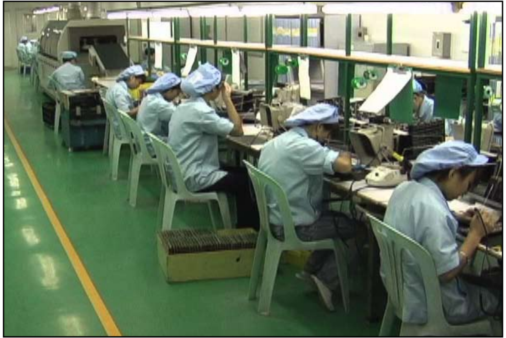
The electronic circuit board assembly line at the Aristo-Craft factory, from Aristo-Craft's DVD "How Model Trains Are Made."

Sample boards can be made in a few days and tested before production. Instead of the hand insertion and solder baths, we have what are called "Pick and Place" machines, where all parts are on reels that are auto-fed into machines that place all of the parts along pre-applied glue strips that hold the parts in place initially. A computer programmer is needed to tell the machine where to place each part and how many of them are needed for each location. Still, the machine can replace hundreds of hand insertion and solder workers and do so in a relative blink of the eye. Usually, there are 20 or more boards made at once as a single sheet and then snapped off for the individual use in a product. The boards are then put through a heating tunnel, where the parts are strongly glued to the boards in a permanent attachment.