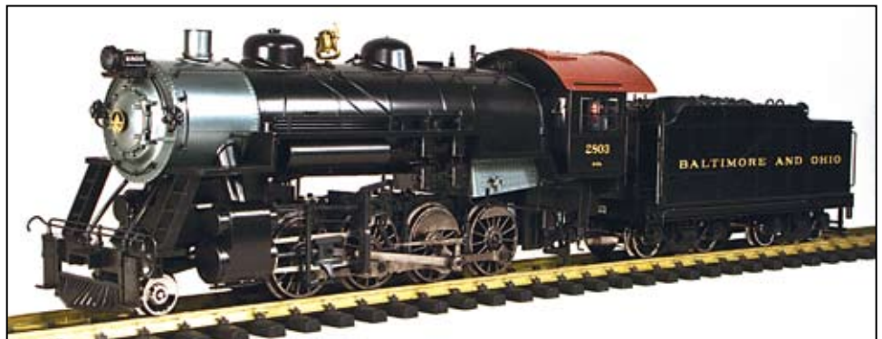
Improved wheels for the Aristo-Craft Consolidation - One of the new product upgrades for 2012

The next run of the Consolidation will have a new wheel with a smaller flange for improved operation on code 250 track, while working as well with code 332 track. We will bring in these newer wheels for replacements when the production of the Consolidation is ready.