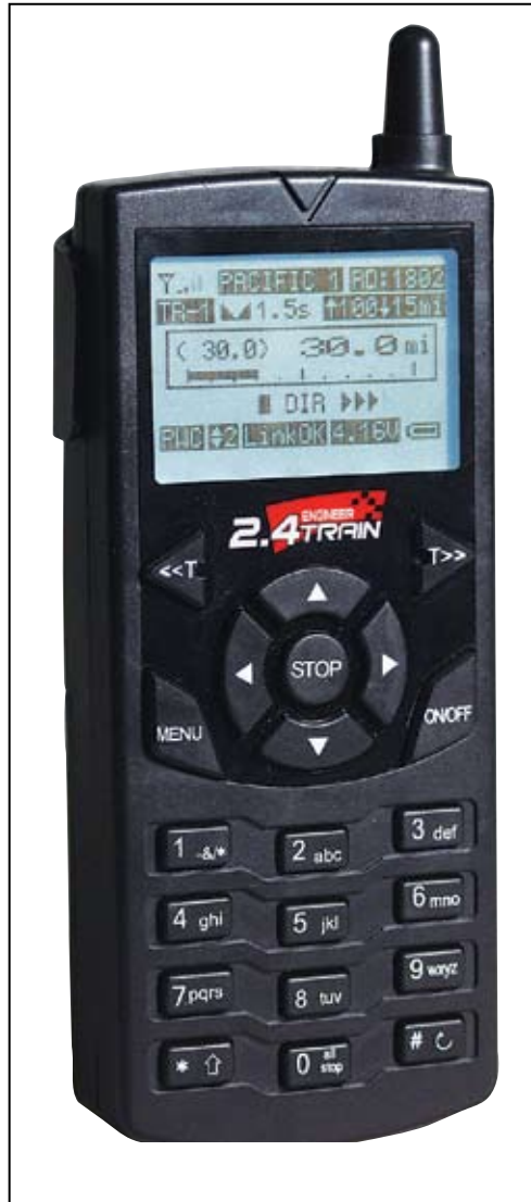
The Revolution will come with interactive sound effects in 2012

Most of these upgrades were begun at least a year ago or longer, but changes like the wheels for the steam locos took all new tools. They had to be designed and tested carefully