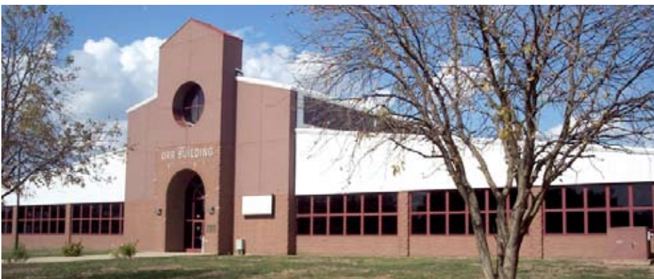
The Orr Building - Site of the 2008 MWLSTS - Springfield, Illinois

Remember, your attendance at these shows is what keeps it going. The more people attend these shows, the more vendors come to the shows. See you all at the shows. Remember to talk the shows up and bring someone new to the shows with you each time. Help the hobby GROW!