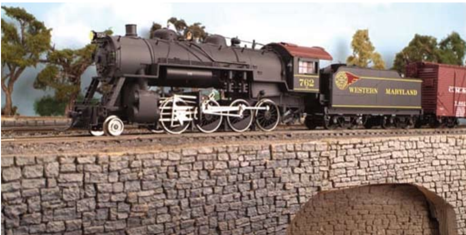
S-HELPER SERVICE'S 2-8-0 CONSOLIDATION ENGINE

All prices listed are MSRP (Manufacturer's Suggested Retail Price)