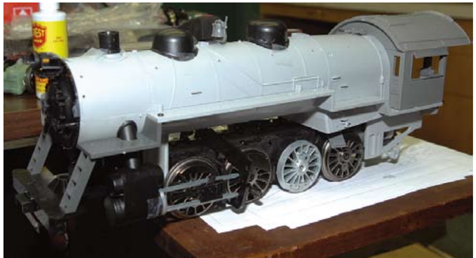
ARISTO-CRAFT'S PRE-PRODUCTION 2-8-0 CONSOLIDATION SAMPLE DUE IN EARLY 2009

Handling tight curves are possible because the engine is designed with blind drivers, so it can negotiate those curves well. However, if you have large curves, we will have an upgrade kit of four flanged drivers available when the locomotive ships to stores. The choice is yours, but either way