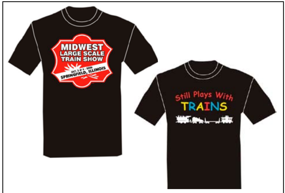
2008 MWLSTS Show T-Shirts

Don't forget to pickup your show t-shirt, too. It will be a black t-shirt with the ever-popular "Still Plays With Trains" on it ($13 for sizes up to XL, $15 for larger than XL). The MWLSTS will be the first show it will be available at. All these items will be available only at the show. You must purchase them AT THE SHOW . No phone orders, no mail orders.