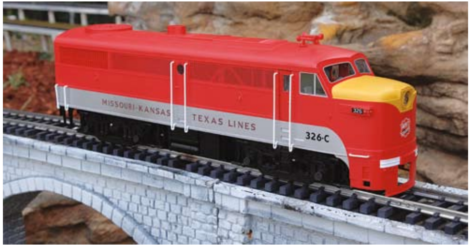
2008 MWLSTS Show Locomotive: MKT Alco FA-1