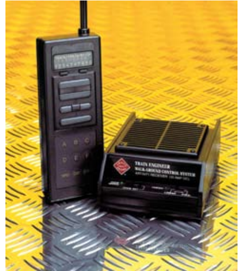
CRE-55470 Train Engineer Transmitter and Receiver

Also helping out, our new Aluminum rail will allow newcomers to enter the hobby at a much lower start-up cost than with brass or stainless steel. We know that it will take 10 years for the hobby to make a significant change, but you have to have a path and this is it. This is my judgment only and I'm not the only one with input, but I am in a position to make this happen at Aristo-Craft and I will. Plug and play, battery power, wireless R/C with no metal wheels required to keep the costs down. We will have the chargers and batteries