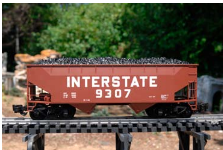
The Interstate 2-Bay Coal Hopper