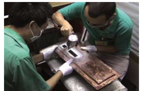
Workers use a spray mask on a loco

was conceived, Aristo-Craft offered customer tours, taking groups of hobbyists to the factory to see the production process firsthand. However, traveling to China is expensive and time-consuming. Hopefully, this DVD will open up that experience to more people,