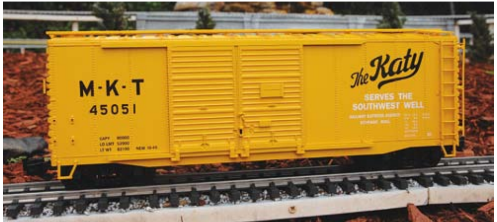
2008 MWLSTS Show Car: MKT Double-Door Boxcar

ACCUCRAFT ARISTO-CRAFT TRAINS COLORADO MODEL STRUCTURES G-SCALE JUNCTION GARDEN RAILWAYS MAGAZINE HARTLAND LOCOMOTIVE WORKS JACK'S TRAINS JOHN'S TRAIN SUPPLY JUST PLAIN FOLK J & W TRAINS, INC. LARGE SCALE ONLINE MIKE SETZER HOBBIES MICHAEL'S CUSTOM WOODWORKING