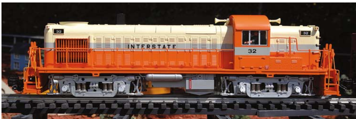
The Interstate RS-3