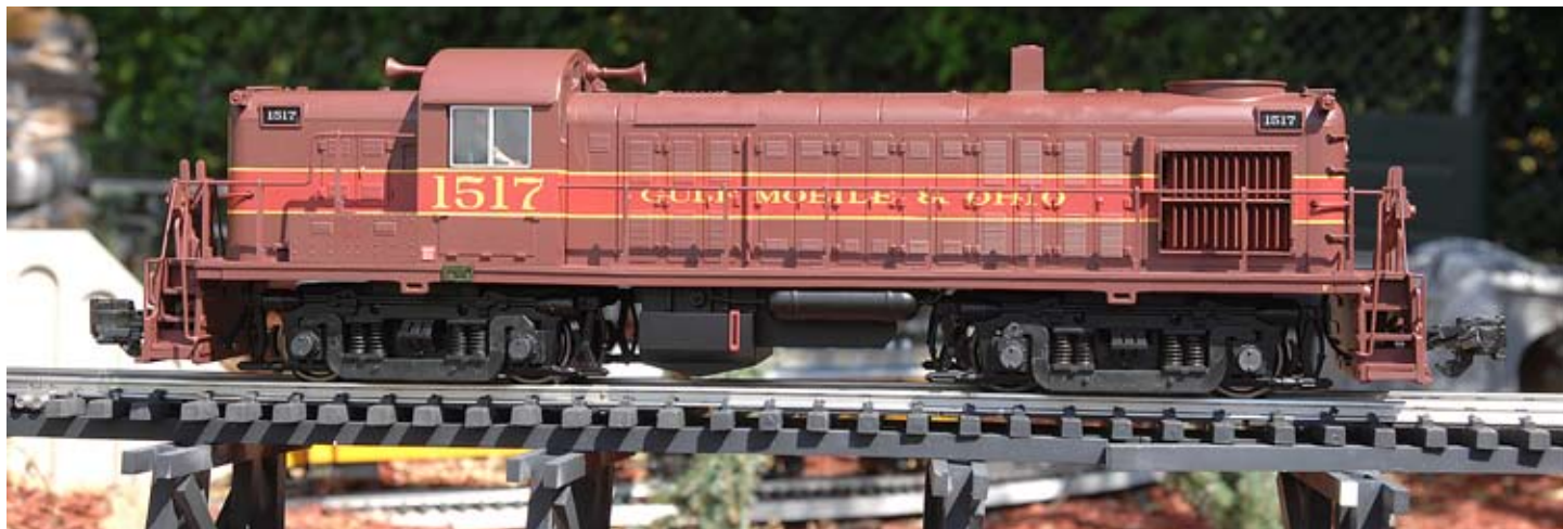
The GM&O RS-3

Here is your first look at the 2008 Aristo-Craft Railroad Club special items. These are the production models that have been approved and sent off for mass production. These exclusive items will be shipping to club members in the fall.