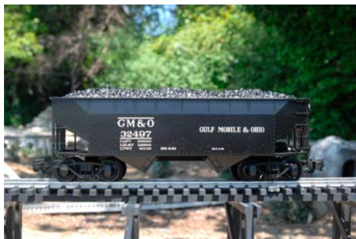
The GM&O 2-Bay Coal Hopper